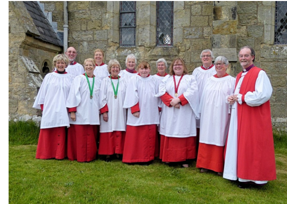
St Michael's Choir at Burythorpe Church in 2015

If you have been a regular at St Michael's for over 20 years you may remember the joint Choral Evensong services we had with the West Buckrose Parish. The choir rehearsal was always followed by a picnic tea (including home made strawberry scones!) before the service. This was an annual event right up until 2020. This year it will happen again at Burythorpe church on 5 th July . The service will be at 6pm. Everyone is welcome.